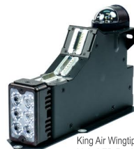
King Air Wingtip Light LED Replacement TC & FAA APPROVED