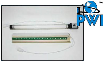
Old Legacy PWI vs New LED PWI