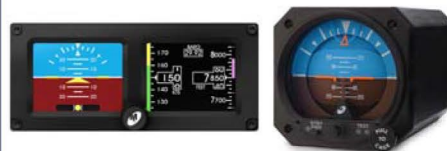
MD302 STANDBY ATTITUDE MODULE (SAM) 4300 LIFESAVER ELECTRIC ATTITUDE INDICATOR