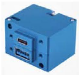
TA 202 Series High Power USB Charging Port