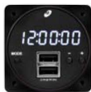
MD93 Digital Clock/USB Charger