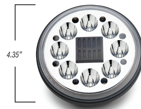
PAR36 PRO LSM-SCD-042-1