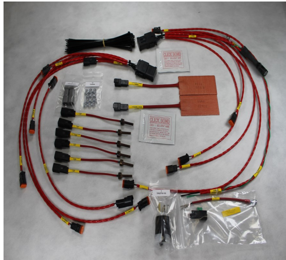
Six cylinder preheat system

Tanis Preheat Flight Safety, Reliability, and Savings- Just Plug It In!