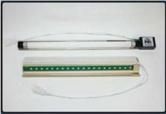
Old Legacy PWI vs New LED PWI

Upgrade your old, inefficient bulbs to an LED direct replacement today. LED's have a longer life span than an incandescent bulb. LED also uses less energy and will not produce any noticeable heat, saving you money and time replacing old bulbs.