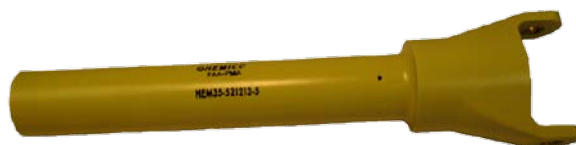
Flap Actuator Housing