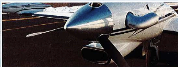
Engine Inlet De-icers