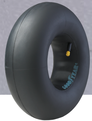
GOODYEAR FLIGHT MATE TUBE

Goodyear Tire Inner Tubes out perform standard BUTYL inner tubes. Goodyear's tube compound is a blend of synthetic and natural rubber which provides great durability in colder temperatures!