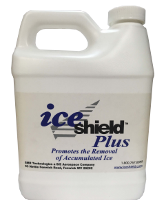
Ice Shield Plus Promotes Removal of Accumulated Ice on De-ice Boots *Alternative to ICE X