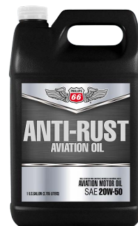
Phillips 20W50 Inhibiting Oil