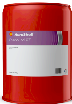
AeroShell Compound 07 On-wing Anti-Ice Fluid *Alternative to Kill Frost