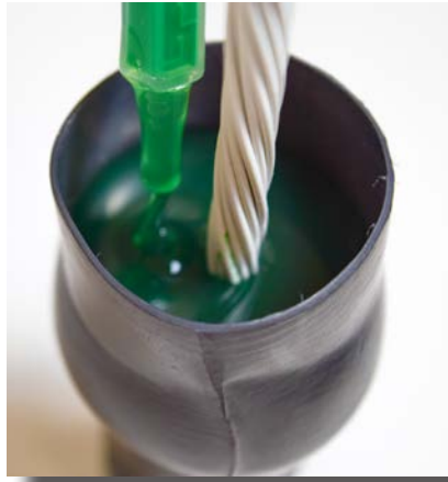
Self-Leveling Green® being injected to connector boot.