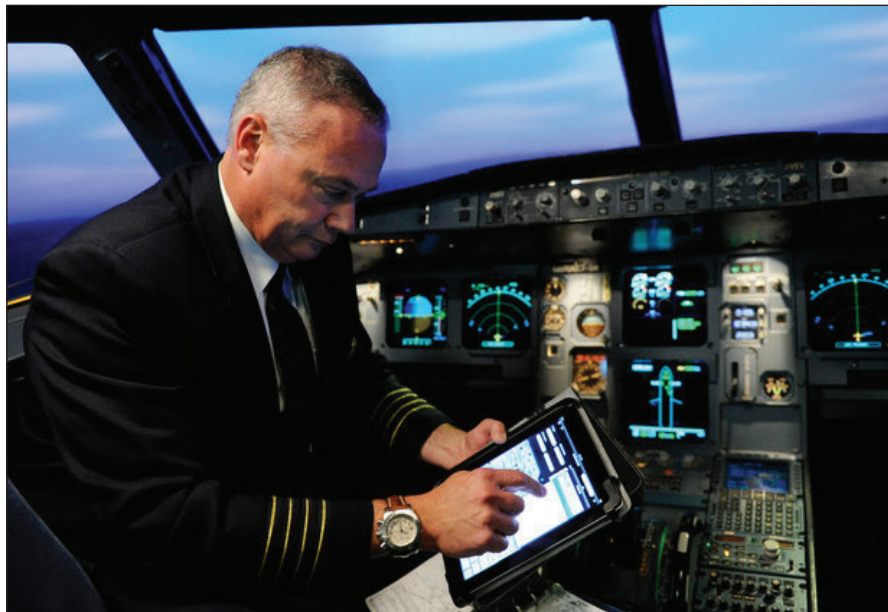
Switching to a paperless cockpit necessitates a source of power for charging tablets and smartphones. A USB system is a simple, low cost solution.

Some airlines are leveraging widespread PED use by delivering entertainment and Internet content directly to a passenger's personal equipment instead of the more traditional LCD screens mounted on seat backs. In theory it's a good idea in that it saves weight and maintenance costs. But there's a caveat: What happens when the PED battery needs charging? Not all aircraft are equipped with seat-mounted power outlets. Having the capability to live stream a movie to a tablet but the inability to watch the movie because of a dead battery is no doubt frustrating. Another flaw is that older generation airframes often have a single AC receptacle for an entire row of seats or place the port in such an awkward location that it requires a mastery of yoga to use it.