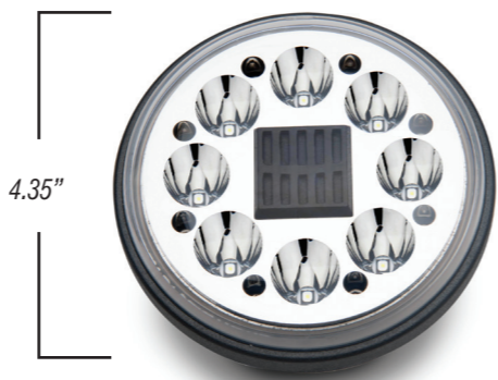
PAR36 PRO LSM-SCD-042-1