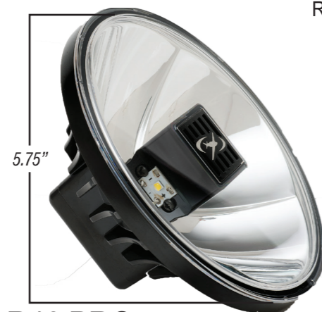
PAR46 PRO LSM-SCD-039-1

FAA STCs included for piston and turboprop aircraft. Jet STCs are available at an additional cost “Drop-In” design offers easy installation and maintenance Power wiring attaches to brass screw terminals Retrofitting for PAR-36 or PAR-46 halogen lamps