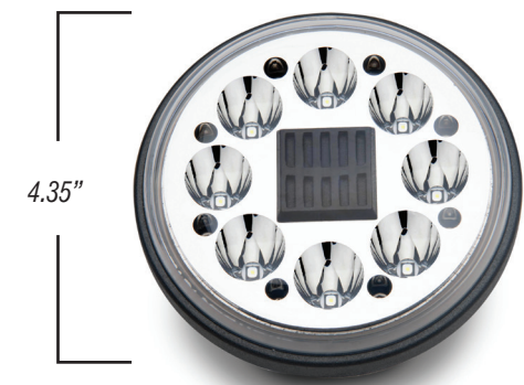
PAR36 PRO LSM-SCD-042-1