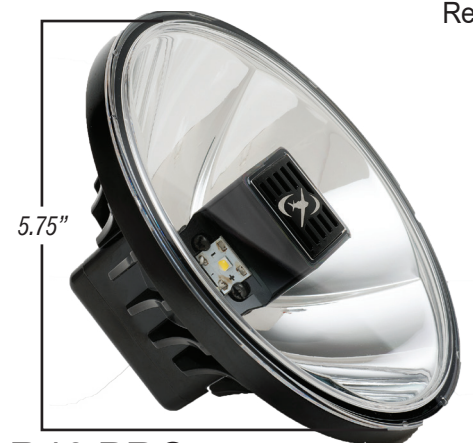
PAR46 PRO LSM-SCD-039-1

FAA STCs included for piston and turboprop aircraft. Jet STCs are available at an additional cost “Drop-In” design offers easy installation and maintenance Power wiring attaches to brass screw terminals Retrofitting for PAR-36 or PAR-46 halogen lamps