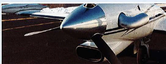
Engine Inlet De-icers