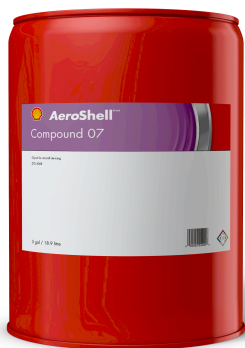
AeroShell Compound 07 On-wing Anti-Ice Fluid *Alternative to Kill Frost